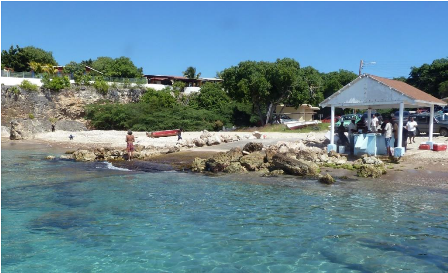
Playa Grandi (Piscado)

If you have an apartment with cooking or grilling facilities, treat yourself to freshly caught fish. Talk to the fishermen with some Papiamentu and you will surely be rewarded with a very friendly conversation. 1 kg of fish costs around 20-30 guilders. You can also swim with the turtles here.