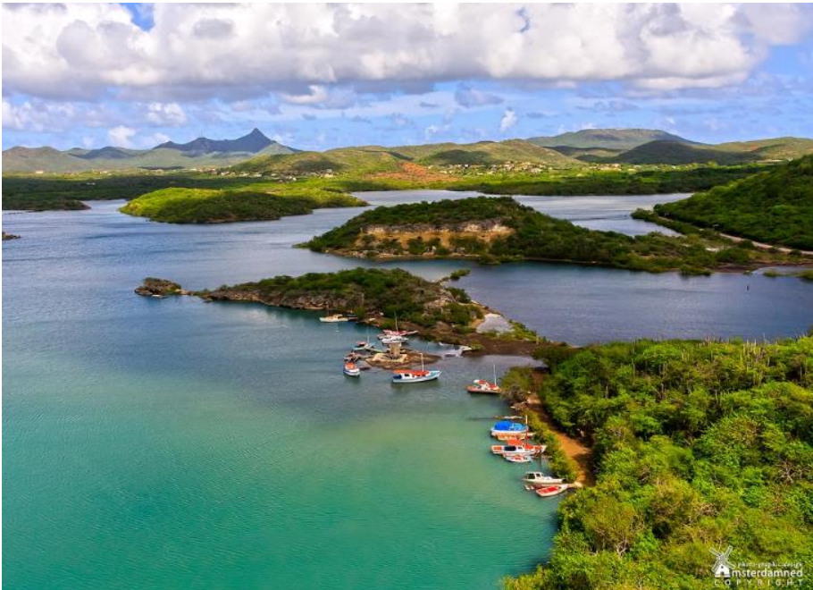
Santa Martha Bay

extensive project to rebuild the run-down former Coral Cliff / Sunset Waters Hotel.