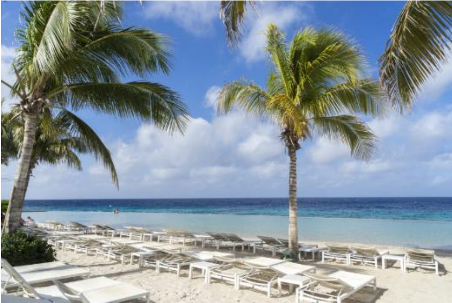
Jan Thiel Beach