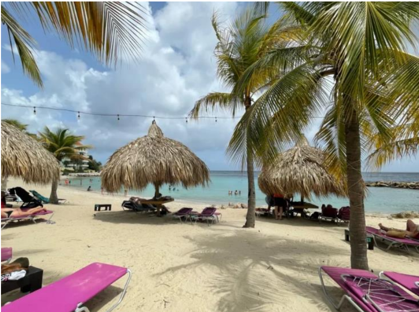
Blue Bay Beach

The beach of Blue Bay is located in the 'Blue Bay Golf and Beach Resort' in the middle of a palm grove. It offers a beautiful white sandy beach and shallow access to the sea. There is everything you could want for a successful beach day: beach chairs, umbrellas, a nice bar with restaurant and a diving or water sports center. The Blue Bay was completed in late 2004. This beach scores with a large restaurant and many shady palm trees. The beach belongs to the "Blue Bay Curacao Golf and Beach Resort". Admission is 15.00 Nafl per person including lounge for one day, children pay half. Divers are exempt from the fee if they purchase an oxygen cylinder from the diving school affiliated with the resort.